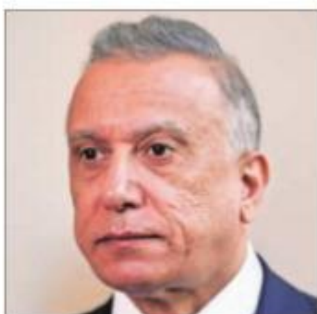
Iraqi PM Mustafa al-Kadhimi

IRAQ'S PRIME MINISTER Mustafa al-Kadhimi survived an assassination attempt with armed drones that targeted his residence early on Sunday. Officials said he was unharmed. The attack was a major escalation amid tensions sparked by the refusal of Iran-backed militias to accept last month's parliamentary election results.