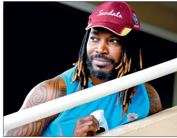
শেষবার মাঠে নামতে চান ইউনিভার্সাস বস।

সংবাদ সংস্থা আবু ধাবি, ৭ নভেম্বর সবাই ধরেই নিয়েছিলেন, তিনি দেশের হয়ে শেষ ম্যাচ খেলে ফেলেন। এমনটা মনে হওয়াই স্বাভাবিক ছিল। কারণ, ম্যাচ চলাকালীন এবং ম্যাচের পর তাঁকে ঘিরে এমন কিছু মুহূর্ত তৈরি হয়, যা দেখে সবারই মনে হয়েছিল, তিনি হয়তো বিদায় বাতাই দিতে চাইলেন।