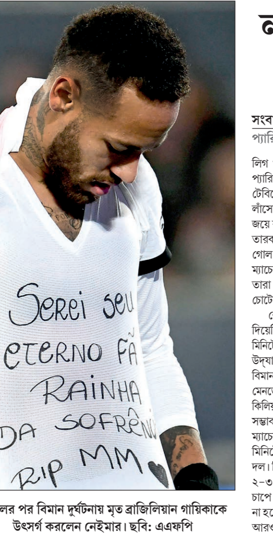
গোলের পর বিমান দুর্ঘটনায় মৃত ব্রাজিলিয়ান গায়িকাকে উৎসর্গ করলেন নেইমার।