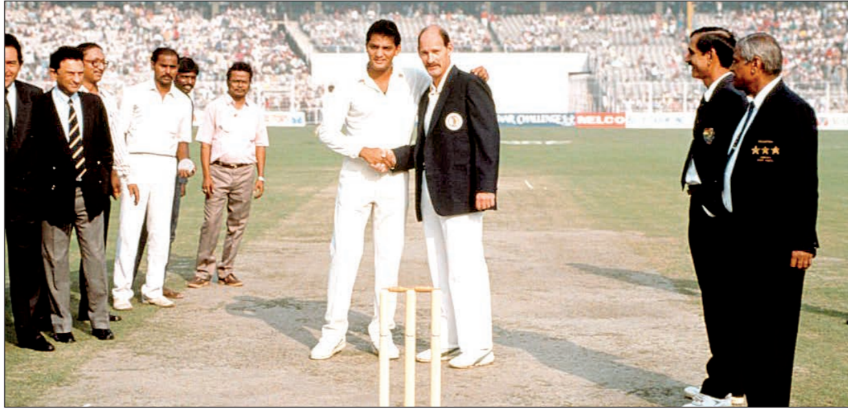
ইডেনে ১৯৯১ সালের ঐতিহাসিক ম্যাচে টেসের সময় মহম্মদ আজহারউদ্দিন ও ক্রাইভ রাইস। ফাইল ছবি

সংবাদ সংস্থা দু'বাঁই, ৭ নভেম্বর ২০২১ টি২০ বিশ্বকাপে সরাসরি সুপার ১২-তে খেলার সুযোগ পাবে না দু'বারের বিশ্বজয়ী ওয়েস্ট ইন্ডিজ। প্রথম রাউন্ডের ম্যাচ খেলে উঠে আসতে হবে শ্রীলঙ্কাকেও। সরাসরি সুপার ১২-তে খেলার সুযোগ পাবে বাংলাদেশ ও আফগানিস্তান।